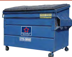
3 or 4 Yard Dumpster

Rent a temporary Debris Box— Earn a Bonus.