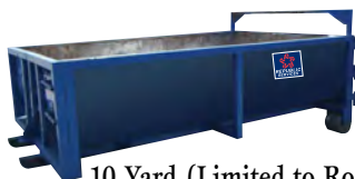
10 Yard (Limited to Rock and Concrete)