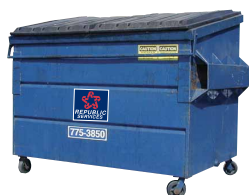
3 or 4 Yard Dumpster

Rent a temporary Debris Box— Earn a Bonus.