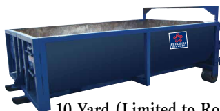
10 Yard (Limited to Rock and Concrete)