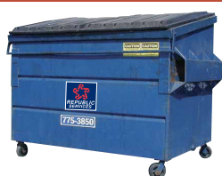
3 or 4 Yard Dumpster

Rent a temporary Debris Box— Earn a Bonus.